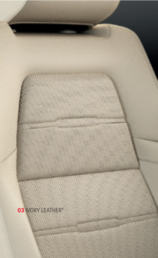
03 IVORY LEATHER*