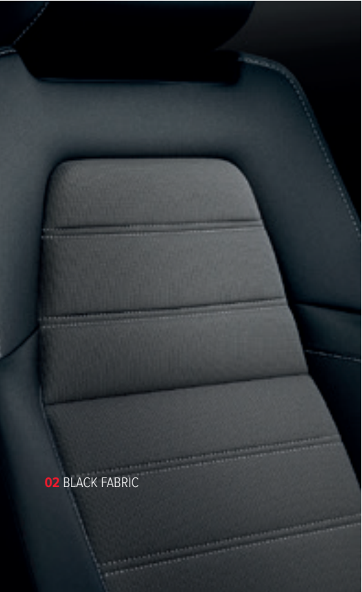
02 BLACK FABRIC